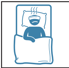
FEVER ABOVE 100.4 DEGREES

Coronavirus (COVID-19) is a contagious respiratory illness caused by a virus. It can cause mild to severe illness, and at times can lead to death. Patients with COVID-19 have a wider range of symptoms than previously thought by medical professionals. According to the newest Center for Disease Control (CDC) COVID-19 symptoms, you should get tested and call your medical provider, if you experience any of the following: