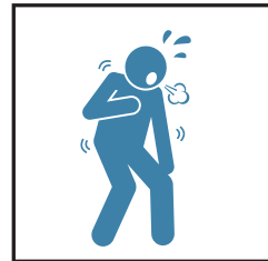
SHORTNESS OF BREATH / DIFFICULTY BREATHING