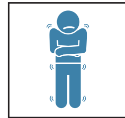
CHILLS OR REPEATED SHAKING WITH CHILLS